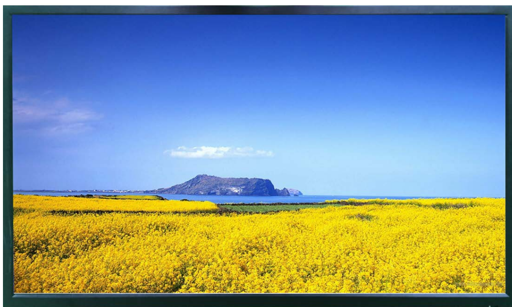
MSE3232-E32 inch LCD Monitor